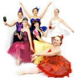
Adirondack Dance Company Snow White & An Evening of the Arts