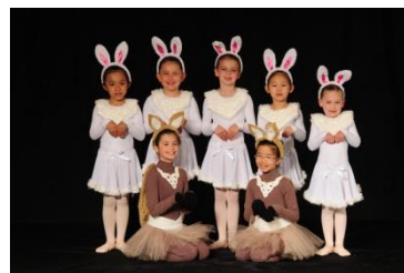
Adirondack Dance Academy 23 Durkee St., Plattsburgh, NY 518-335-7385