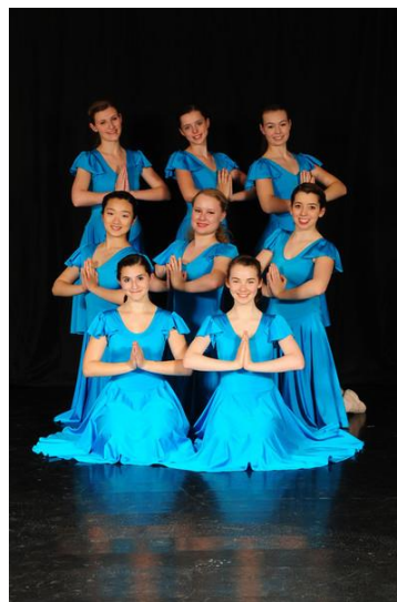
Adirondack Liturgical Dance Troupe